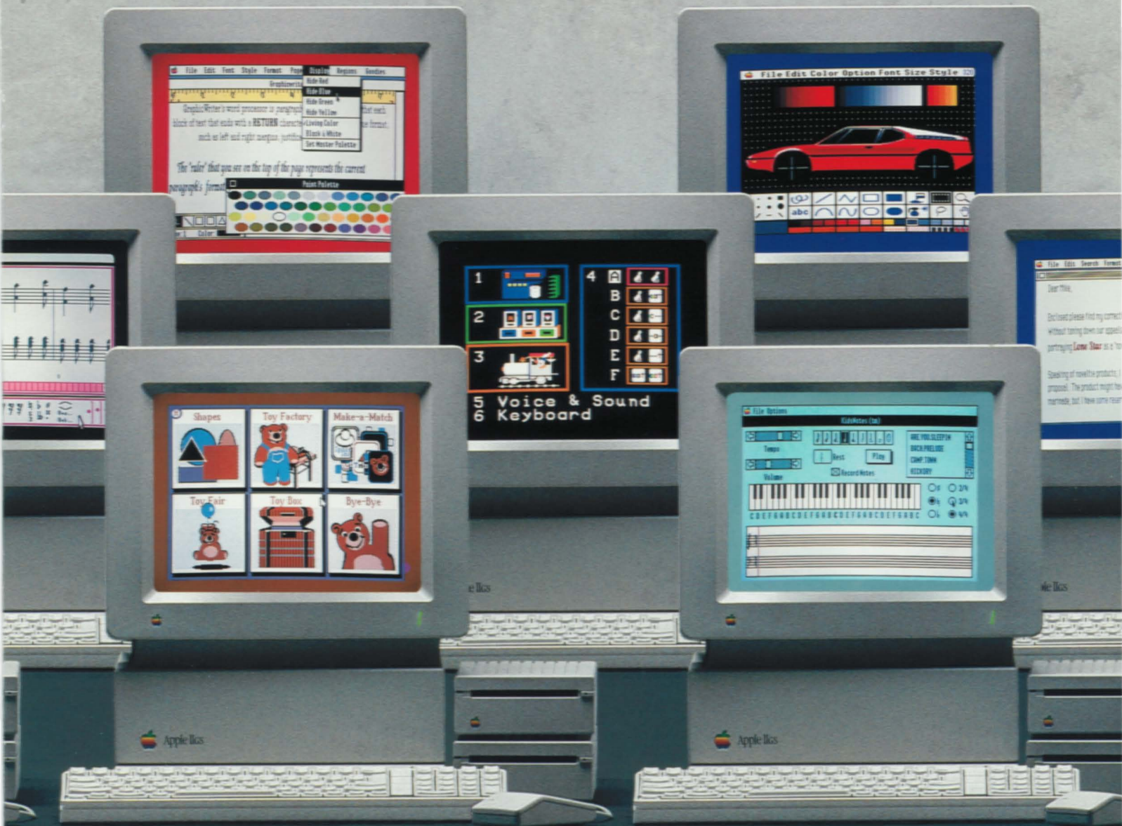
GraphicWriter from DataPak— Word Processing and Graphics