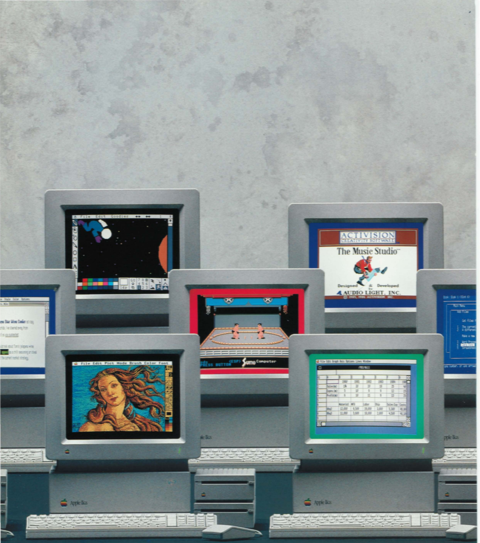
Fantavision from Broderbund— Animation